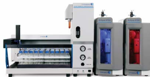
Dual Eclipse 4760 with the 4100 Soil/Water Autosampler