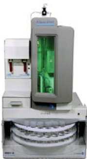
Eclipse 4760 with the 4551A/ LV-20 Autosampler for Water