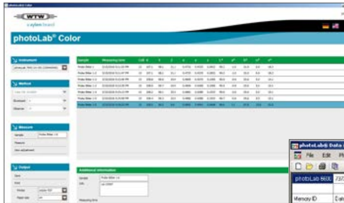
Intuitive user-interface for easy color measurement and data management

The PC software for photoLab® 7000/6000 Series consists in two individual modules offering a powerful photo-metric color measurement (CIE, Gardner, Yellowness...) and a GLP-compliant data management.